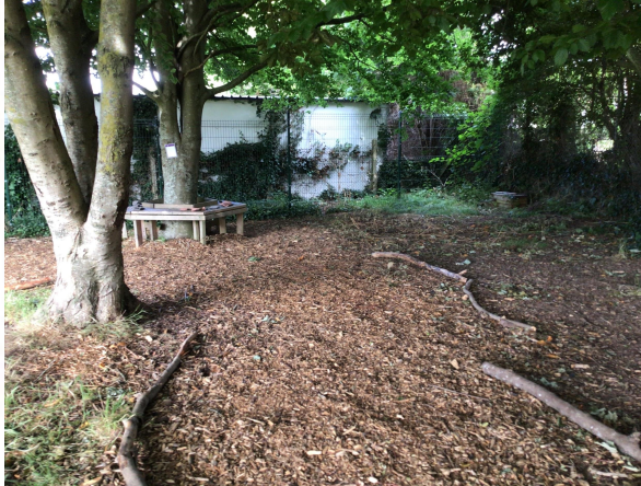
Outdoor learning spaces