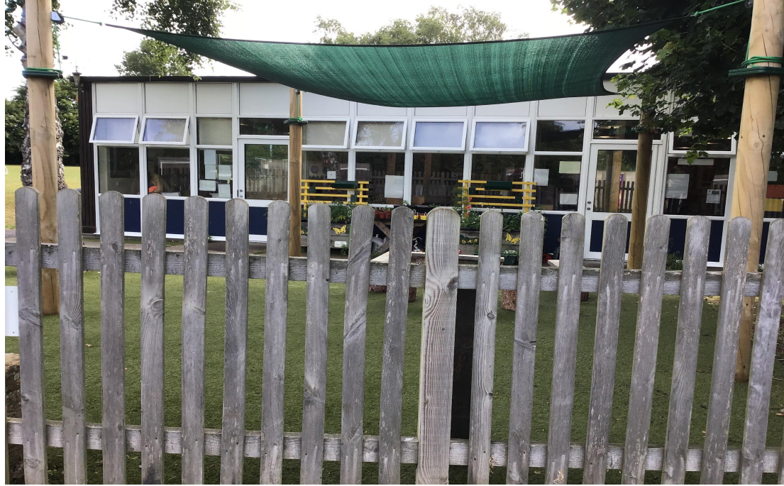
Year 3 outdoor area