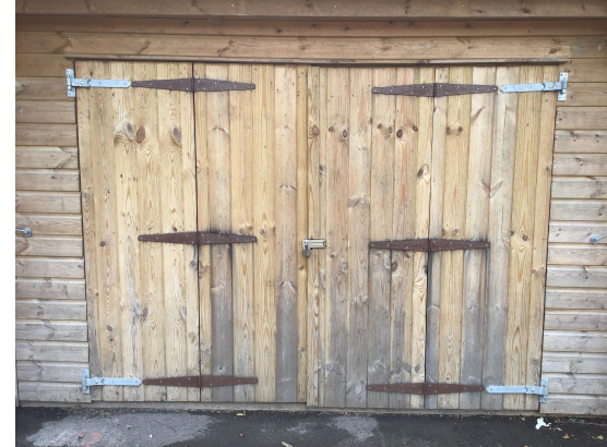
Reading Shed and lots more....